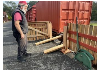
New gate, ramp and fence modifications near the GY Wagon