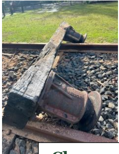
Clean up of the Buffer at the end of the Rail track