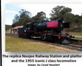
The replica Noojee Railway Station and platform and the 1955 iconic J class locomotive prior to last month

See reverse for application form and sponsorship details