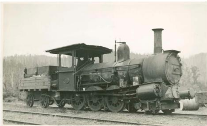
Goodwood Timber Company, Noojee Victoria, 1936

'It was lovely all through the bush, very dense undergrowth, and the great tall tree trunks. The engine flung out showers of sparks, but a kindly stoker was on duty to extinguish me if I was smouldering in more than two places at once! We got out at the Goodwood Saw mills, right in the heart of the forest. I shall never forget it!'