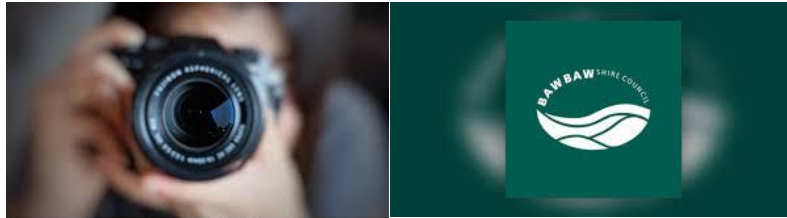
PHOTO SHOOT AT THE NOOJEE

Baw Baw Shire Council (BBSC) organised for a professional photographer to visit Noojee on Saturday 12 April 2025.