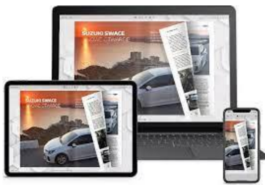
An example of a flip pages:

This project will be rolled out over the next year, and its progress will be displayed on a large screen in the Platform and Goods Shed.