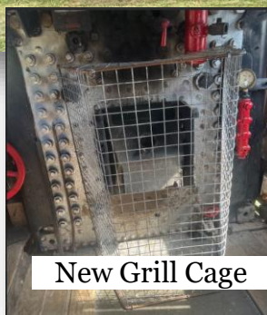
New Grill Cage